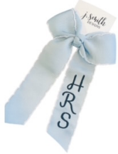
Light Blue HRS Bow $15.00