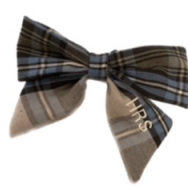
Plaid HRS Bow $15.00