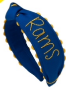
Rams Headband $25.00

Orders will be sent to production on the 1st and 15th of each month. Once the order is submitted, please allow approximately 2 weeks for production before items are ready for pickup or delivery.