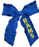
Blue Rams Bow $15.00