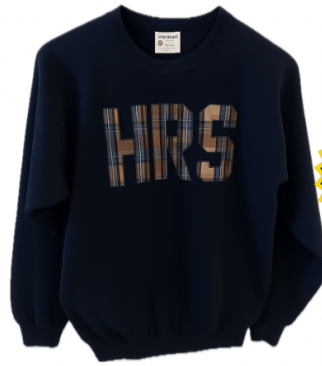
Navy Uniform Approved for All Grades