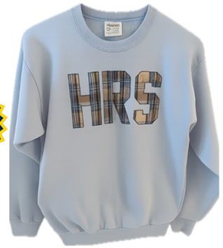
Light Blue Uniform Approved for 2K-5th Grades