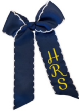
Navy HRS Bow $15.00