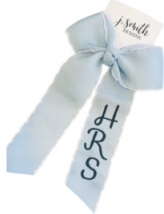
Light Blue HRS Bow $15.00