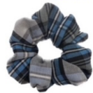
Plaid Scrunchie $10.00